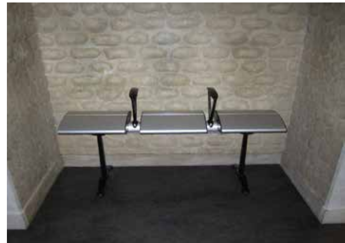
There is seating in all the main areas